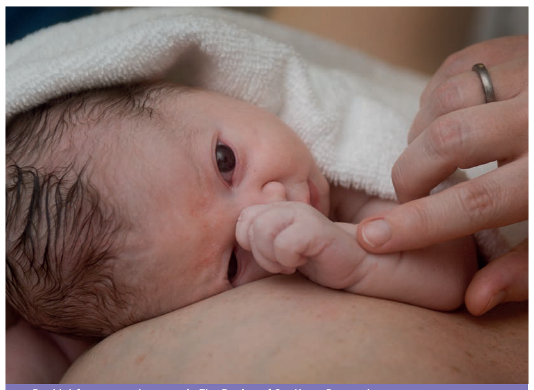
Booklet for pregnant women in The Region of Southern Denmark